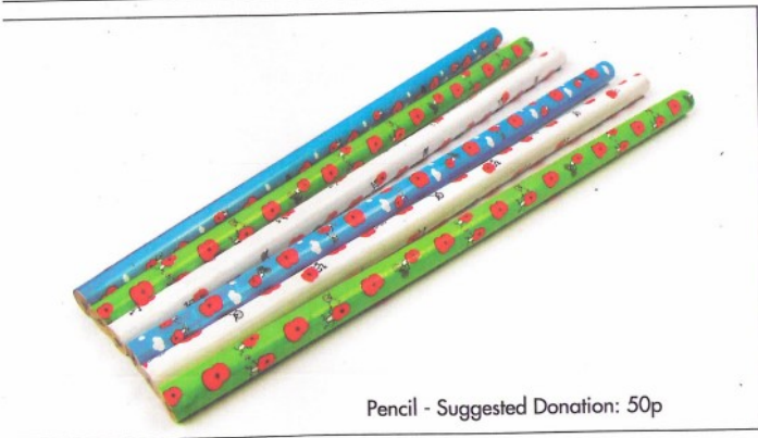
Pencil - Suggested Donation: 50p