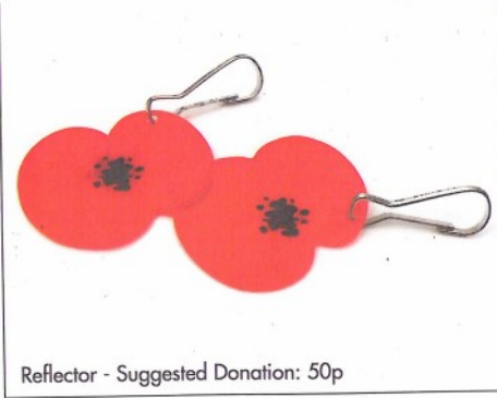
Reflector - Suggested Donation: 50p