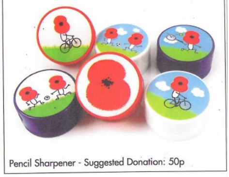
Pencil Sharpener - Suggested Donation: 50p