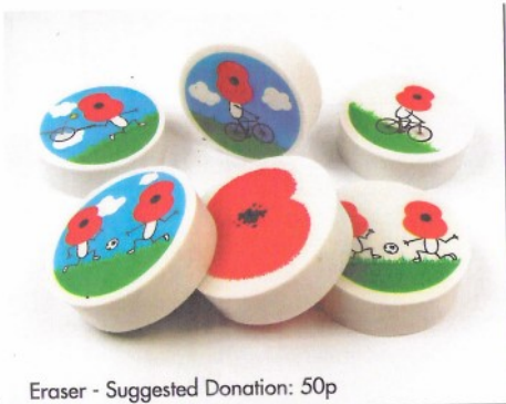
Eraser - Suggested Donation: 50p

IT IS THE POPPY APPEAL. WE HAVE VARIOUS ITEMS FOR SALE BELOW FOR THIS VERY WORTH-WHILE CHARITY. IF YOUR CHILD WOULD LIKE TO PURCHASE ANY OF THE ITEMS BELOW, WE WILL BE SELLING THEM FROM MONDAY